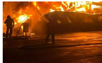
28m Sunseeker Black Diamond destroyed, IMS Shipyard, Saint-Mandrier, France.