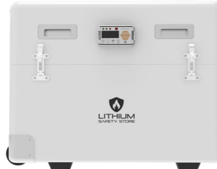
LF120 - $4,860+TAX L680 x W530 x H535mm / 120 litres