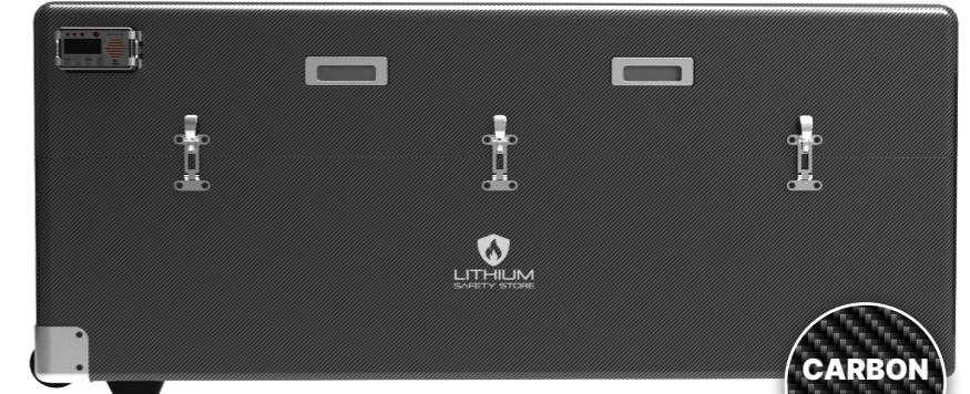
LF335-CF - $9,660+TAX L1330 x W605 x H592mm / 335 litres