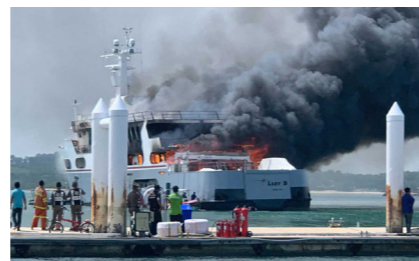
Fire on yacht MY Lady D, port of Lignano Sabbiadoro, Italy