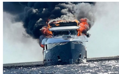
Fire on motor yacht MY Blue Magic, bay of Naples, Italy.