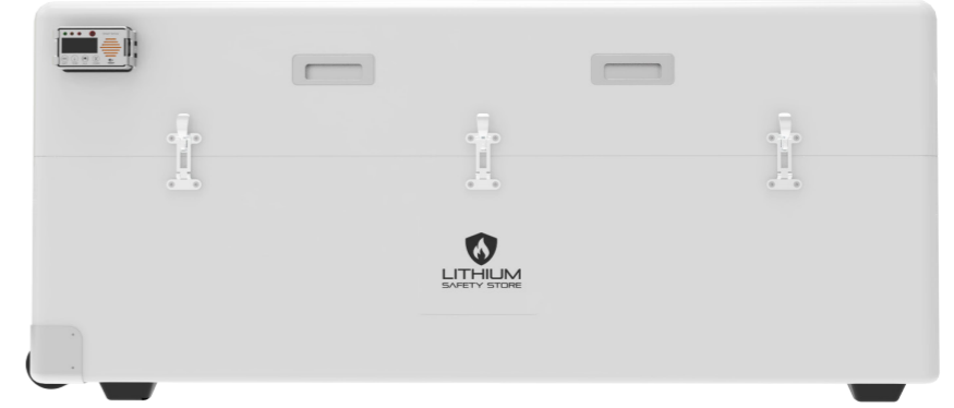
LF335 - $7,870+TAX L1330 x W605 x H592mm / 335 litres