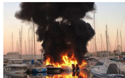
Fire ravaged three 8m boats in the port of Lavandou, France.