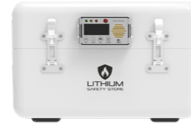
LF18 - $3,325+TAX L430 x W330 x H280mm / 18 litres

Please place your order with your local stockist (found on the back cover)