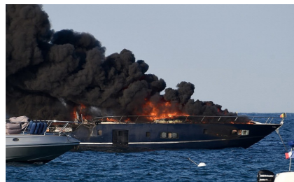
Fire broke out on sailing yacht L'Odyssee, bay of Saint-Tropez.