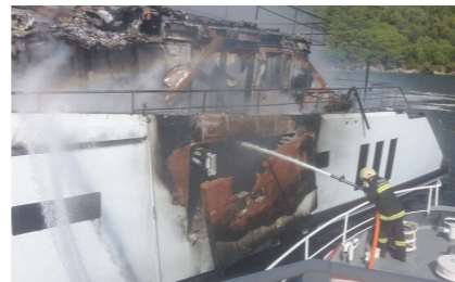
Lithium e-board fire destroys 44m MY Kanga, Dubrovnik, Croatia