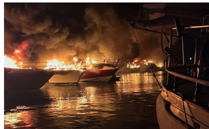
Fire Destroys 8 yachts docked in La Paz, Mexico

Google search yields hundreds of such incidents, underscoring the critical importance of proper lithium battery storage. This issue is now a top priority for boat owners, captains, and marina managers alike, who are all keenly aware of the risks and the need for effective safety measures.