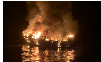
34 people died in lithium blaze, Santa Cruz, California