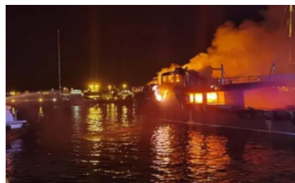
Superyacht MY Siempre, moored at the port of Olbia, Italy.